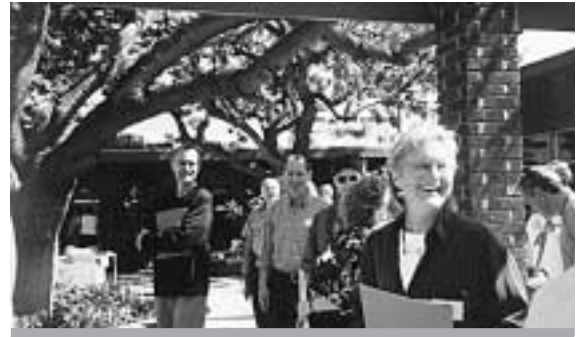
Equipping the Saints participants.