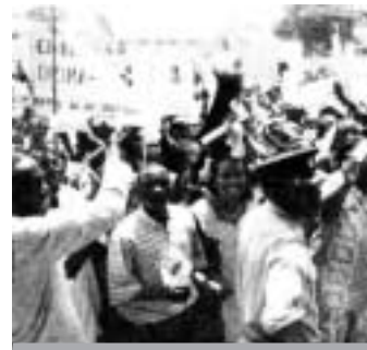
Integrity Uganda demonstrators

A Ugandan newspaper reports that Bishop Senyonjo sent them a press release stating that he has resigned as chairman of Integrity Uganda. The paper printed several quotes from the bishop’s latest letter out of context.